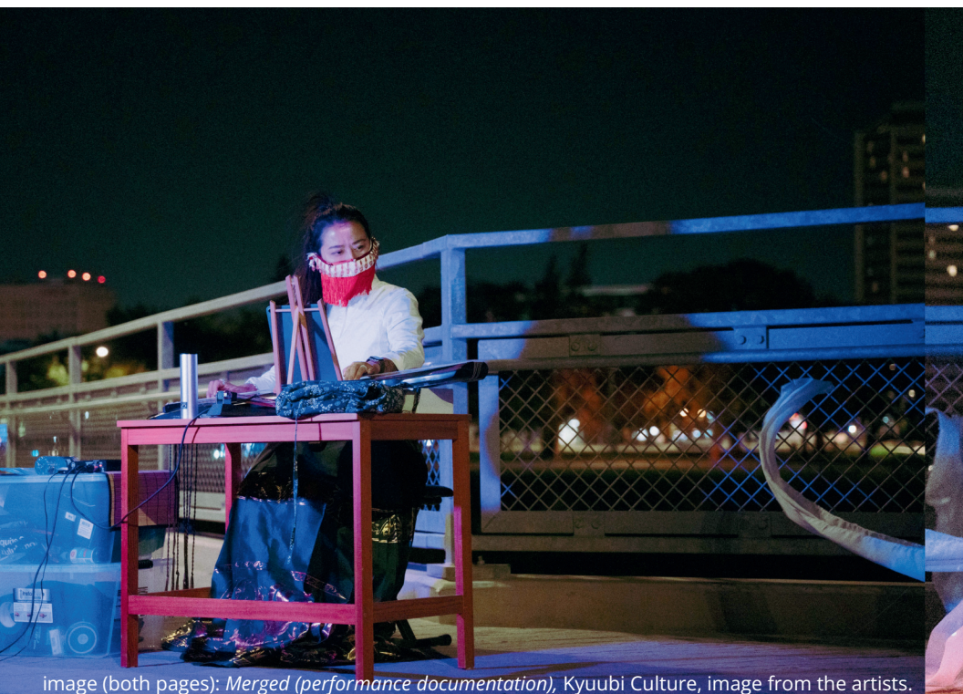
image (both pages): Merged (performance documentation), Kyuubi Culture

Silent Gathering: of Grief and Remembrance fosters intercultural dialogue focusing on diverse cultural perspectives on death and creation. Incorporating stories gathered from community members and workers in death-adjacent industries, Kyuubi Culture's exhibition theArt Gallery