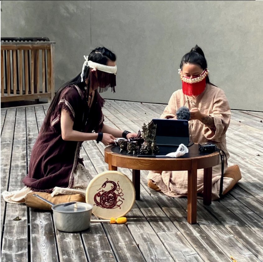
Image: World Tea Salon (event documentation), Zyuubi Culture. Photo by Ingrid Percy, 2022.