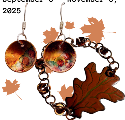
image left: Golden Foliage , Elaine Gohlke. Right: Oaktastic , Kyla Klincke, 2025.