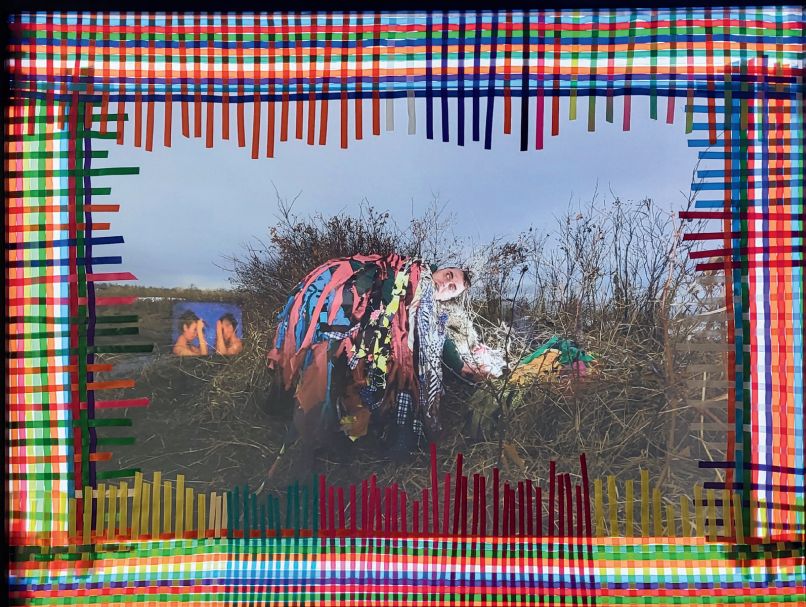
image: Chimera , installation view, Theo Pelmus and Kristin Snowbird, 2025.