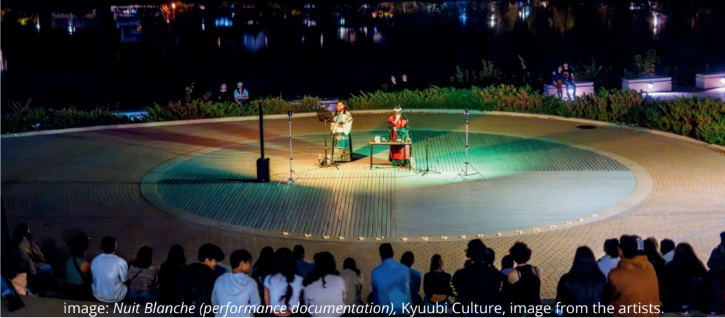
image: Nuit Blanche (performance documentation), Kyuubi Culture, image from the artists.

of Regina will span disciplines such as costume, interpretive dance, photography, and sound.