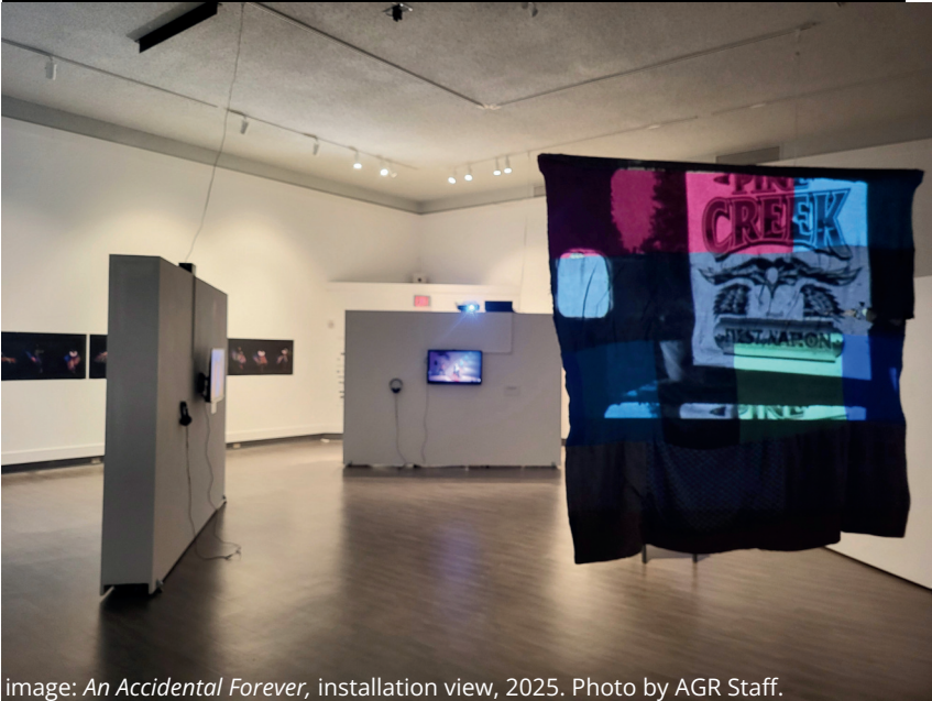
image: An Accidental Forever , installation view, 2025.