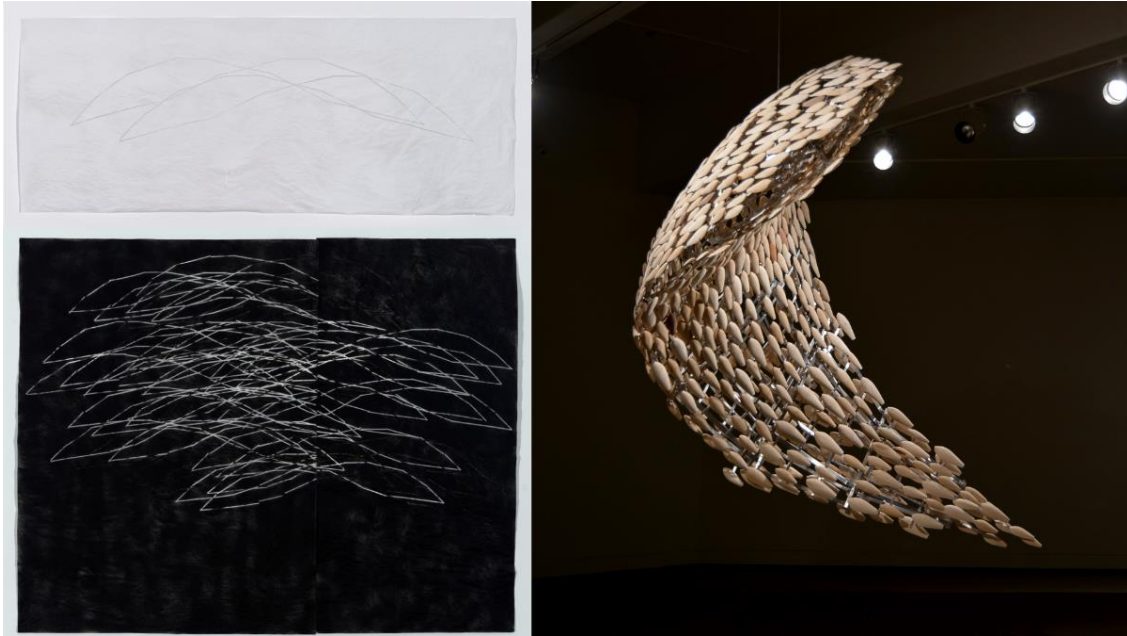
Image: (left) Nikki Middlemiss, Untitled (from the Elevate Series ), 2020. Photo courtesy of the artist and Guy L'Heureux.; (right) Peter Tucker, Holon , 2020. Photo courtesy of the Moose Jaw Museum & Art Gallery.

Artists in the exhibition Elevate & Holon reveal abstraction's sensitive side in their delicately shaped lines, shapes, and volumes.