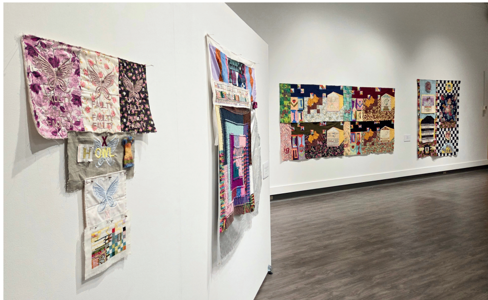
image above: installation view of Art Thou the Accuser of Thy Brethren, or Art Thou the Inspiration of Their Heart? at the Art Gallery of Regina.