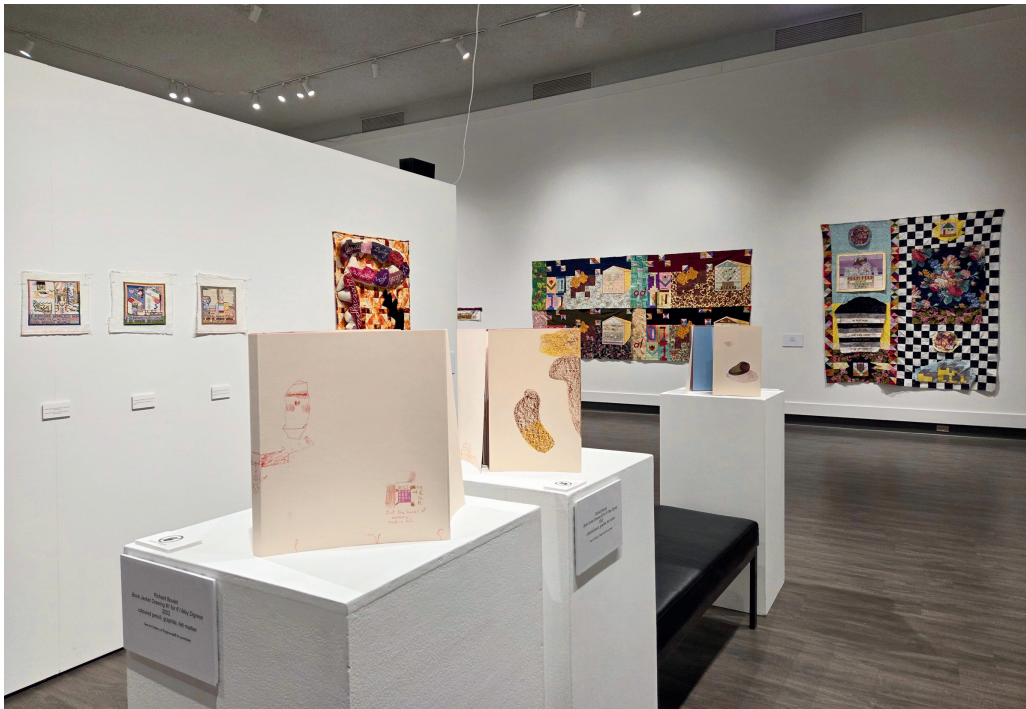
image below: installation view of Art Thou the Accuser of Thy Brethren, or Art Thou the Inspiration of Their Heart? at the Art Gallery of Regina.