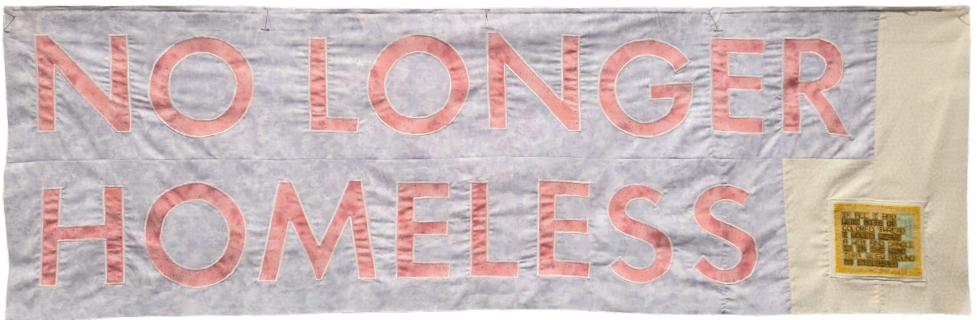
No Longer Homeless , Richard Boulet, 2003.