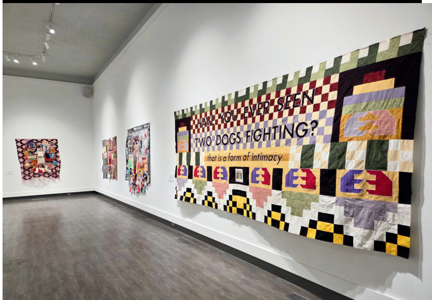
Installation view of Art Thou the Accuser of Thy Brethren, or Art Thou the Inspiration of Their Heart? at the Art Gallery of Regina.