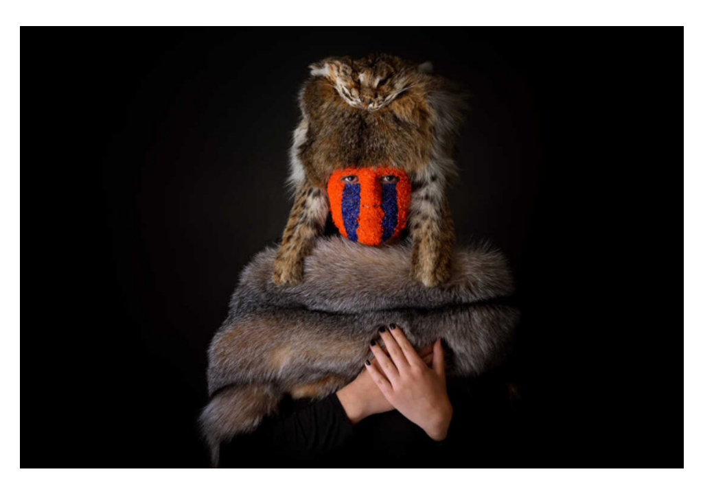
Oh My Heart, Marcy Friesen, photograph, 2022..