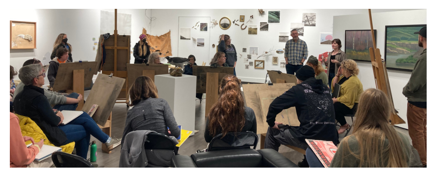
Still Life drawing in the gallery, a partnership with the Royal Saskatchewan Museums. October 2023.

Over the past year, the AGR has been working to strengthen and expand our partnerships and collaborations with other arts and community organizations, with funding assistance from the Canada Council for the Arts. Our ongoing partnership with Holophon Audio Arts is a prime example of this initiative. We are now pleased to announce Sharing Space: A Festival of Community and Nonprofit Art Experiences.