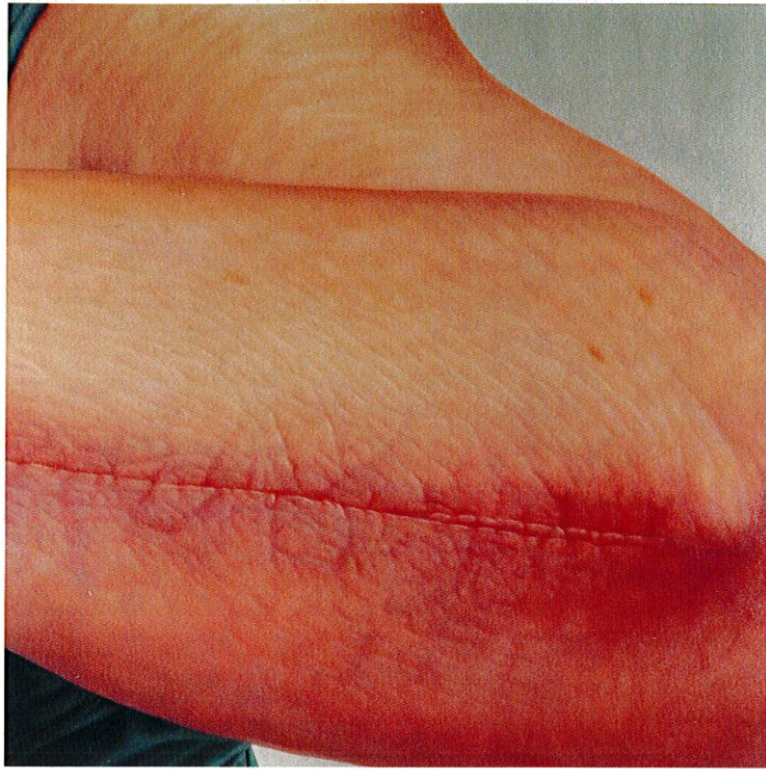
Louise , oil on canvas, 117.5 x 117.5 cm, 2007