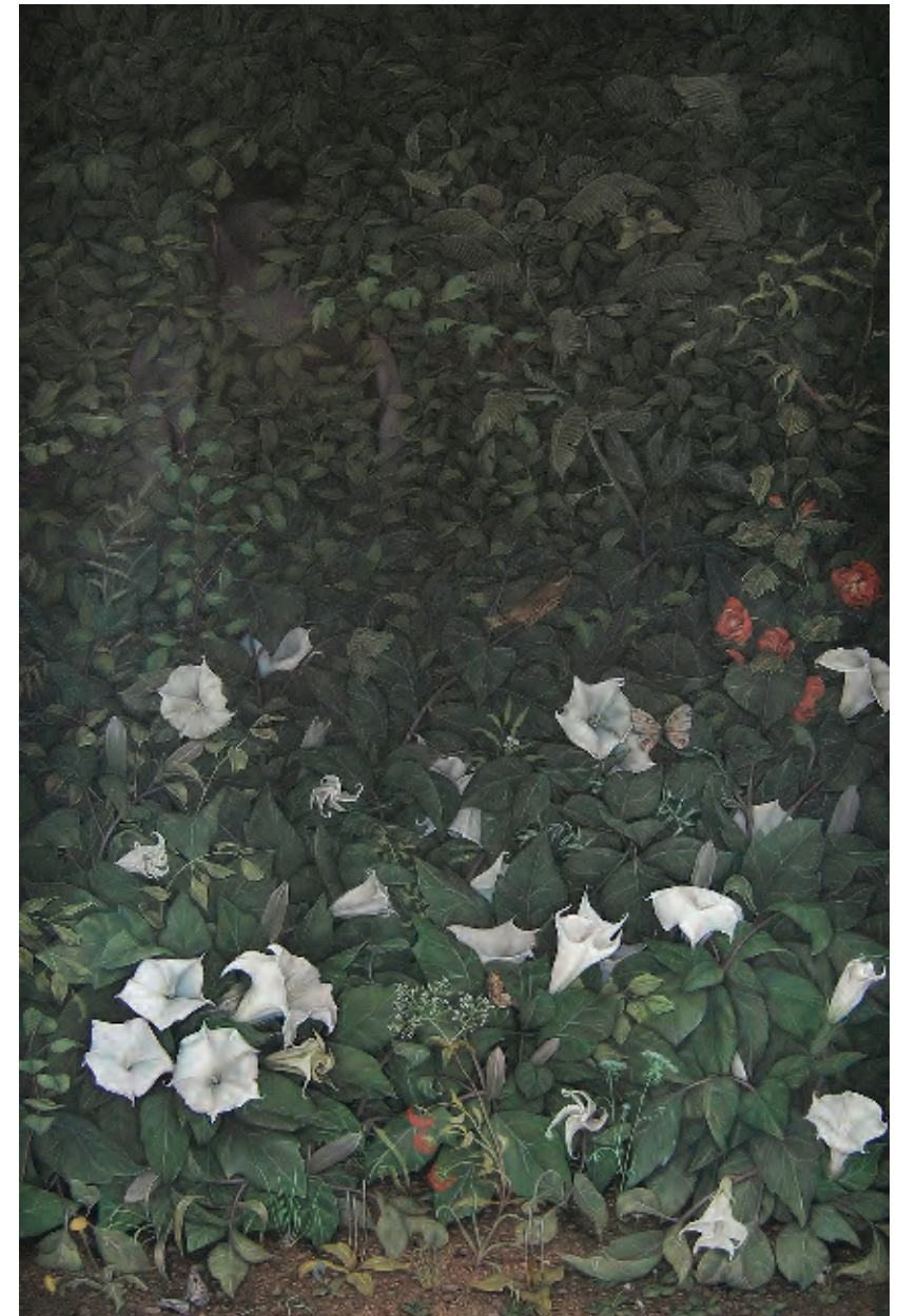
Eunuch Tapestry 4 , 2014 pastel on black paper 84 x 96"