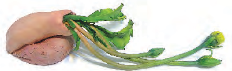
Root 2 , 2015 acrylic on hand-built ceramic 12 x 5 x 3"