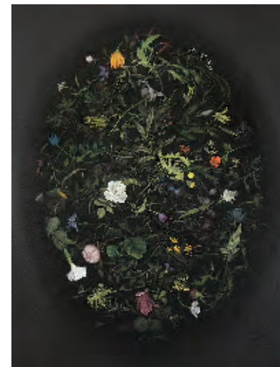
Pool , 2015 pastel on black paper 59 x 84"