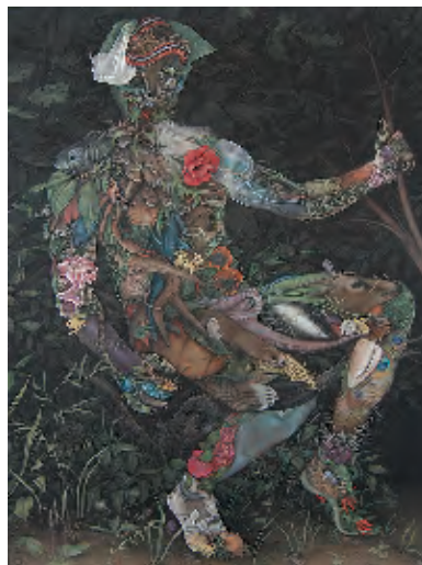
Leshy 2 , 2014 pastel on black paper 50 x 70" Private collection