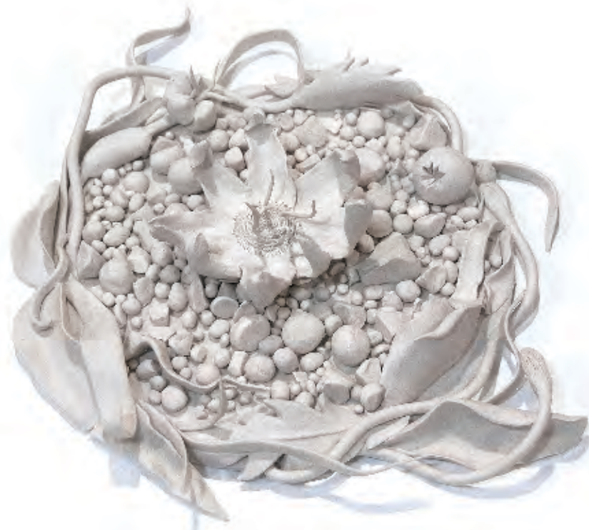
Circular Ditch , 2015 hand-built ceramic 14 x 13 x 3"