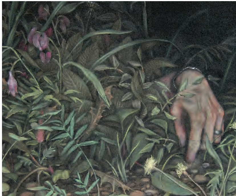
Seeding (detail) , 2013 pastel on black paper 38 x 120"